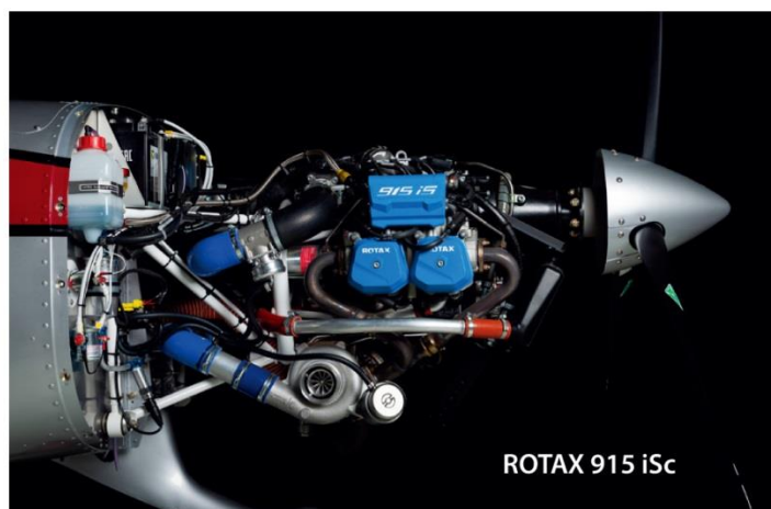
ROTAX 915 iSc